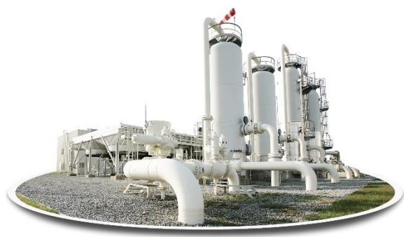
Press Photo 4