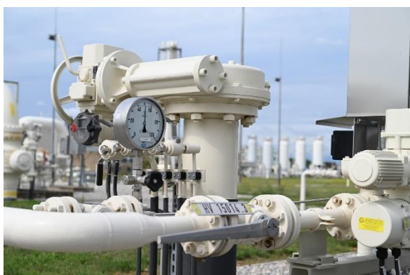
Press Photo 3