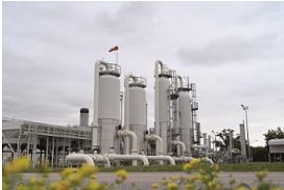
Press Photo 7