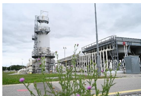
Press Photo 6